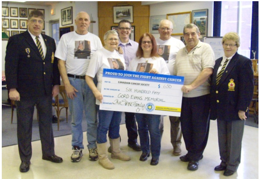
The Gord Evans Memorial Dart Tournament raised $650.00 to donate to the North Bay chapter of the Canadian Cancer Society

If you know someone that might be interested in helping out, please let them know we need them. If you are interested in helping out yourself, please call the office at 705-752-3773 and let us know of your interest.